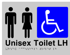
Unisex Toilet LH