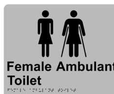
Female Ambulant Toilet