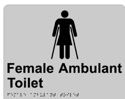
Female Ambulant Toilet