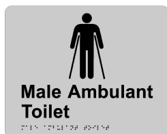
Male Ambulant Toilet

RBA4330-800 Series Polycarbonate Braille & Tactile Signs