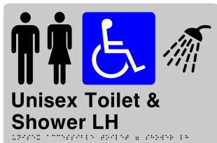
Unisex Toilet & Shower LH