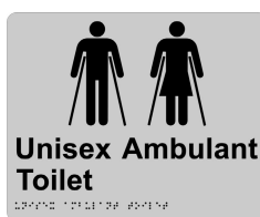
Unisex Ambulant Toilet