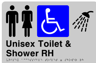
Unisex Toilet & Shower RH