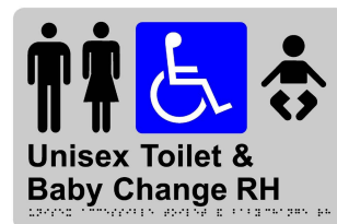
Unisex Toilet & Baby Change RH