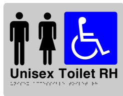
Unisex Toilet RH