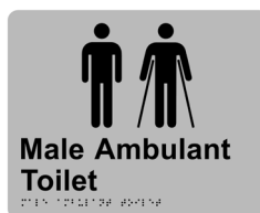
Male Ambulant Toilet