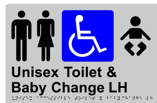
Unisex Toilet & Baby Change LH