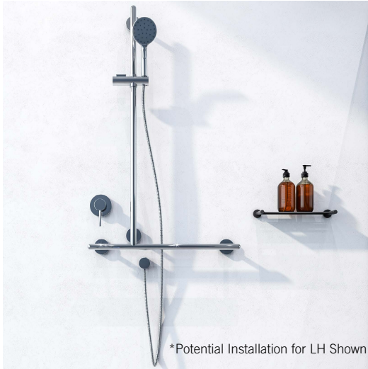
*Potential Installation for LH Shown

Important: Installation instructions and current rough-in details should be furnished with each fixture. Do not rough in without certified dimensions. Dimensions are subject to manufacturer's tolerance of +/-10mm.