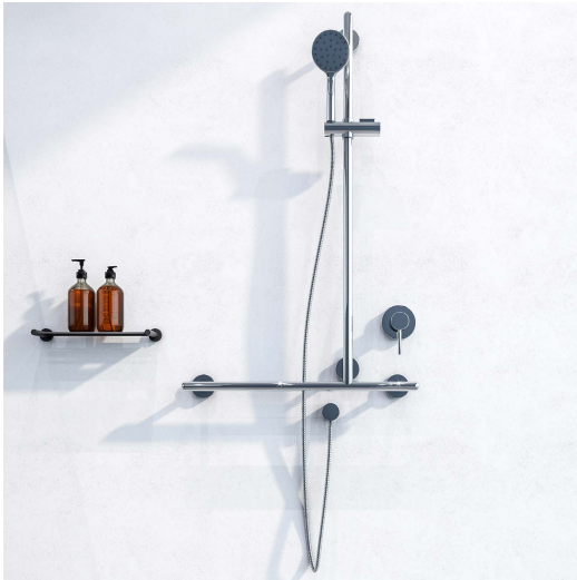
*Potential Installation for RH Shown