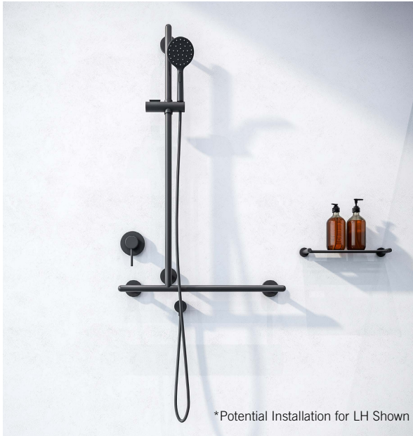
*Potential Installation for LH Shown

Important: Installation instructions and current rough-in details should be furnished with each fixture. Do not rough in without certified dimensions. Dimensions are subject to manufacturer's tolerance of +/-10mm.