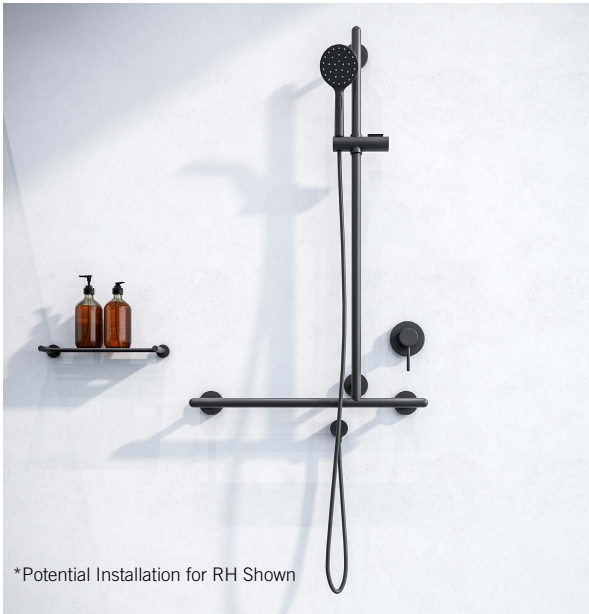
*Potential Installation for RH Shown