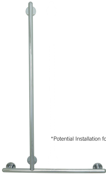
*Potential Installation for LH Shown

Important: Installation instructions and current rough-in details should be furnished with each fixture. Do not rough in without certified dimensions. Dimensions are subject to manufacturer's tolerance of +/-10mm.