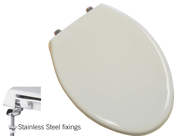
Stainless Steel fixings