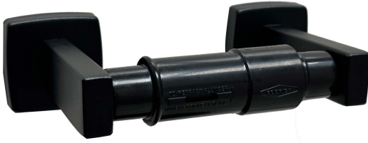
* RBA7742-777-001.60 Shown

Flanges & Support Arms: 0.8mm Type 304 Stainless Steel Concealed Wall Plate: 1.0mm Type 304 Stainless Steel Finish: Matte Black Powder Coated Fixings: Supplied